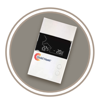
Thermostat that includes a floor heat sensor.